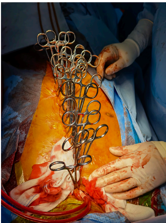
Fig. 2 - Sternum clamped with towel forceps on both sides to control hemorrhage.

aortic root was difficult, distal aortic anastomosis was performed by DHCA, then the artificial vessel was blocked after anastomosis. Once hemorrhage was controlled, circulation was restored, and a drainage tube was placed in the right upper pulmonary vein or at the apex of the heart. For mitral valve surgery, a superior vena cava cannula was routinely placed. For patients who required aortic arch replacement during surgery, routine right innominate artery cannulation was selected for cerebral perfusion. Intraoperative left common cervical cerebral perfusion was prepared depending on cerebral oxygenation. The specific surgical procedures performed on the 11 study patients are described in Table 2.